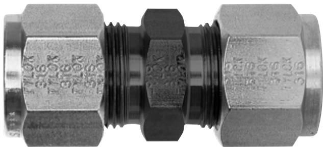
Tylok® is a registered trademark of Tylok International, Inc.

Tantaline® treatment uses high-end Chemical Vapor Deposition techniques to deposit a uniform, diffusion bonded layer of corrosion resistant tantalum onto very intricate shapes and smaller sizes of fittings while maintaining critical tolerances. Tantaline® treated fittings offer better corrosion resistance than austenitic stainless steels which cannot fight stress corrosion, chloride attack, and especially sulfide cracking. The metallurgical properties of the tantalum surface combined with the uniform and conformal CVD layer results in superior acid resistant fittings that have excellent compatibility in most aggressive acids and can be offered with economical pricing and short lead-times.